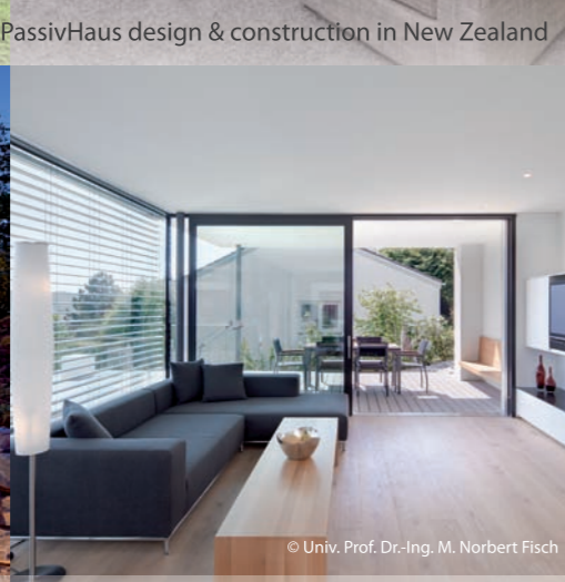
First Net-Plus-Energy House with electricity load management and e-mobility · Stuttgart · Germany