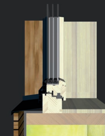
3D - Installation detail for ENEREGATE 963