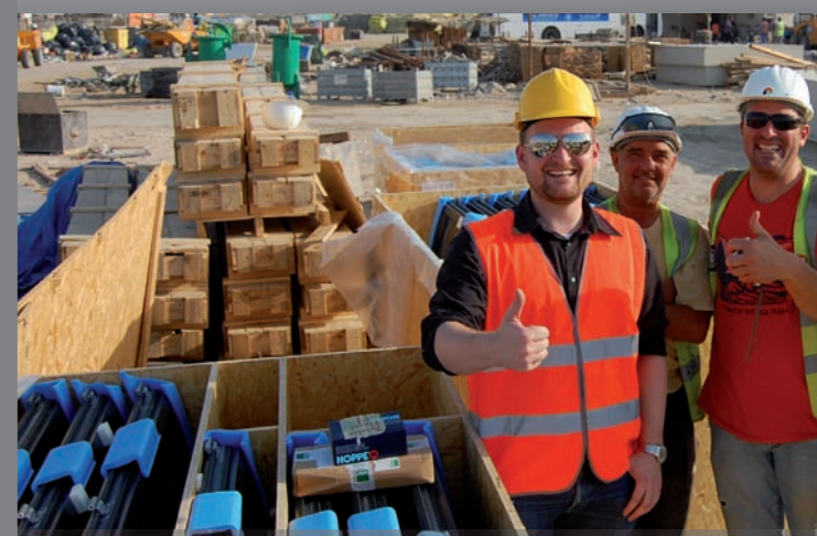
Delivery · MASDAR City · Abu Dhabi · UAE