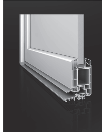
uPVC Entrance door system ENERGATE 762