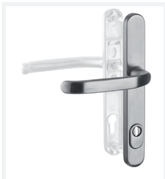
Lever handle set - narrow plate: handle / handle stainless steel rosette outside security version