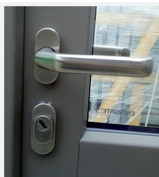
Handles cranked version: handle / handle stainless steel rosette oval - outside security version