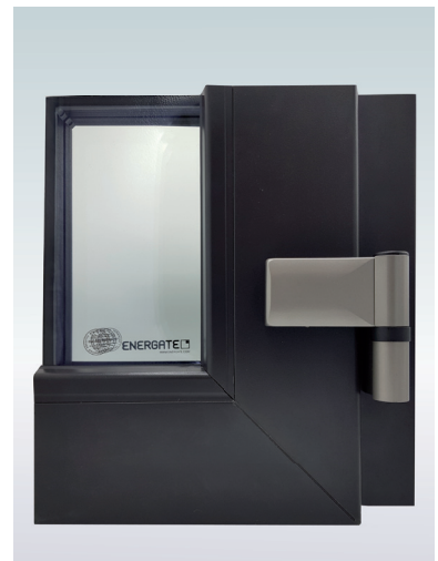
Product sample uPVC color: Graphit black Hinges: butt