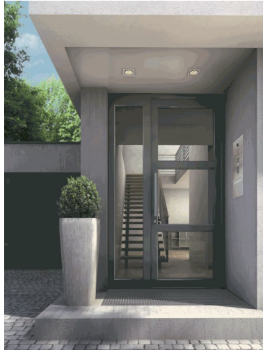
2.102 muntin main entrance door with fixed side light